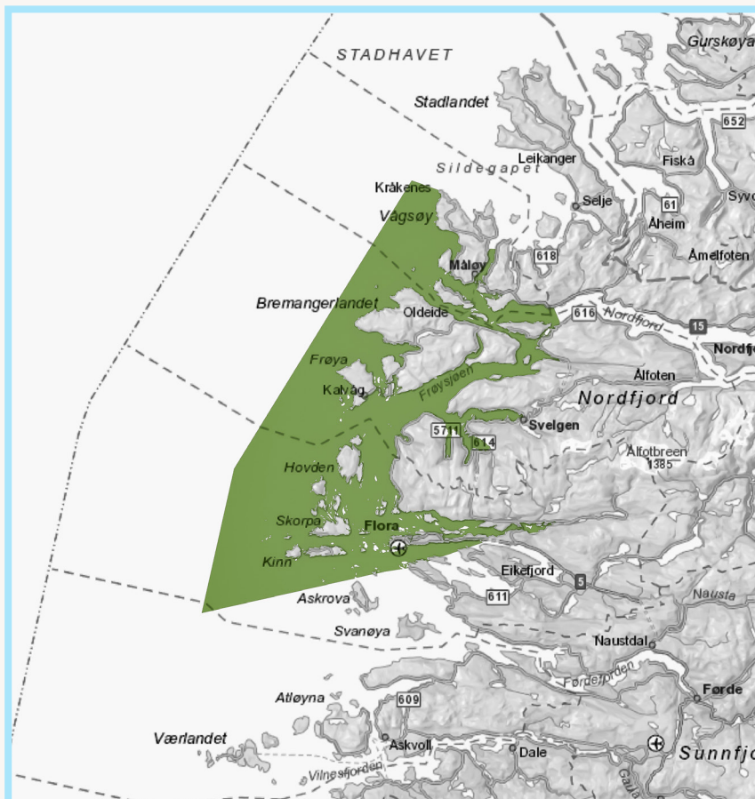
VTS Area - Kinn Vessel Traffic Service